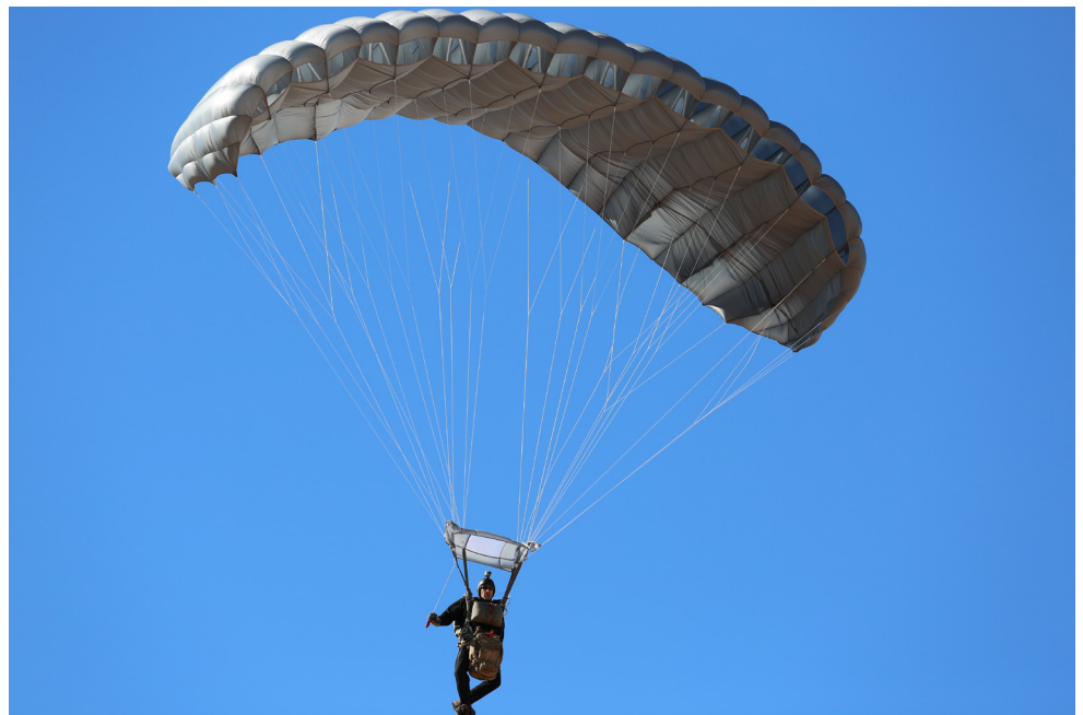
Hi-5 Reserve Canopy