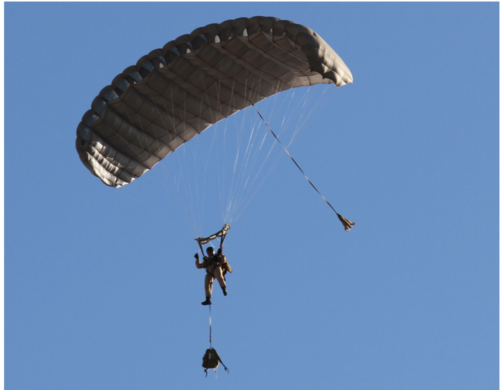
Hi-5 Main Canopy

Additional toggles on the front risers allow the jumper to modulate the glide of the canopy gradually from the >5 to 1.5. The glide modulation can be performed with the steering toggles still in hand. This feature can be used while flying in formation to maintain a tight stack, to lose altitude quickly over the target without having to do spirals or S-turns. It can be used for very accurate landings, even on a small Drop Zone. The Glide Path Modulation is a unique and powerful tool for any type of military free fall operations.