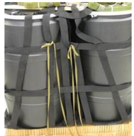
Cargo container slings