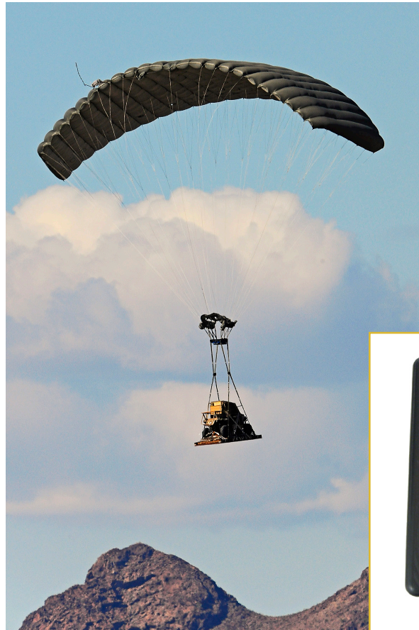
RazorFly™ carrying a Polaris MRZR4 vehicle.

The Airborne Systems jTrax Mission Planner is also capable of running simulated missions using the included terrain mapping software. Simulating missions before an actual airdrop allows the aircrew to ensure surrounding terrain will have no effect on the mission.