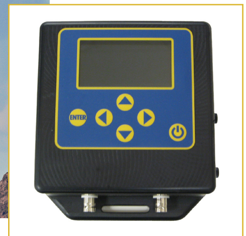
Remote Control Unit